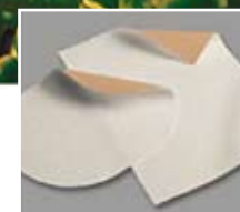
GORE DUALMESH® PLUS Biomaterial inhibits MRSA adherence and resists initial Biofilm formation.